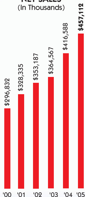
NET SALES (In Thousands)